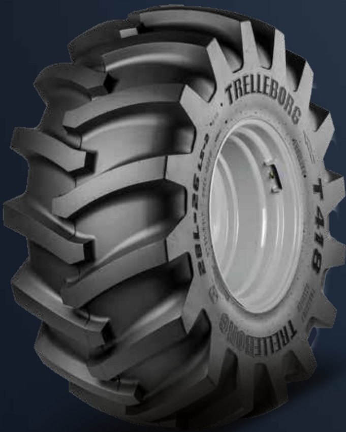
Forestry Skidder T418